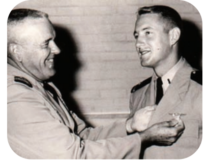
A young Hank Brown in the U.S. Navy.