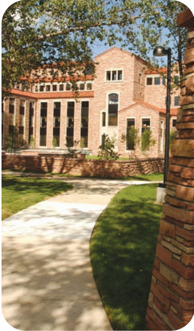
The Wolf Law Building at the University of Colorado Law School.

For Hank Brown (JD '69), the University of Colorado Law School provided a rigorous professional education in an atmosphere befitting his stalwart leadership abilities. Since then, he has pursued a lifetime of achievement and service to society at every turn. Throughout a career that has included the U.S. Navy, Monfort of Colorado, state and federal elective office, the Daniels Fund, and the presidency of the University of Colorado, Brown's leadership and civic commitment have exemplified the highest hopes we have for our graduates.